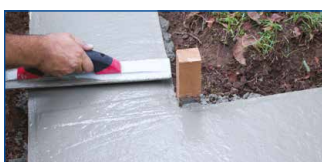
Screed, trowel and finish