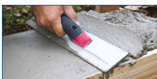
Trowel or screed to level