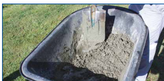
Measure, add water and mix