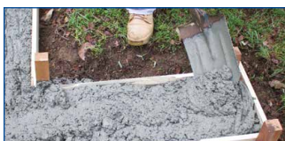
Pour and spread